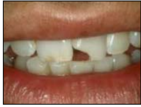
A broken tooth

Any activity that could result in a fall or a blow to the head puts your child at risk for mouth injuries. Lost or broken teeth are the most common kind of mouth injury, but accidents may also cause concussions, jaw bone fractures and dislocations, as well as damage to orthodontic appliances and the jaw joint. Fortunately, mouthguards can help protect your children from these expensive and painful injuries.