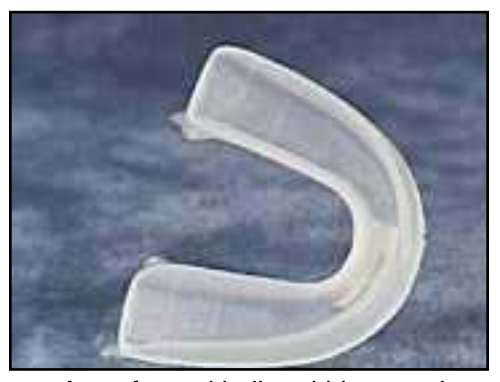
An unformed boil-and-bite guard