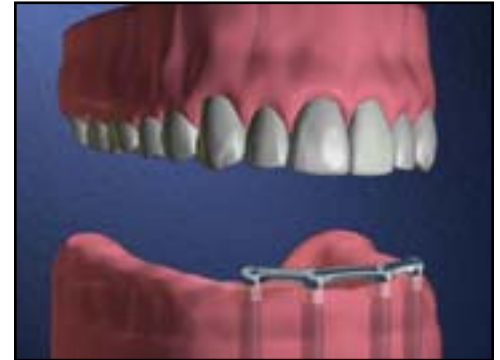
Lower jaw implants

Restoring your lower jaw with dental implants is accomplished in two phases. The first phase of the procedure is the surgical placement of the implants. They're under the gums for several months while the bone attaches to them. After healing, the second phase begins. We re-expose the implants and make your new teeth.