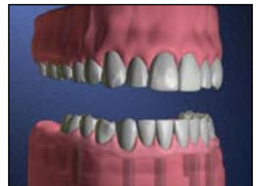
A restored lower jaw

The second phase starts with surgical re-exposure of the implants. Incisions are again made in your gums and small extensions are placed to bring them above the gum line. We then start a series of appointments to make your new teeth. Though some of the steps might be different in your case, they usually include making impressions of your mouth. From these impressions, we make precise working models of your mouth, which are carefully mounted for proper alignment. It's on these models that your new teeth are fabricated. The last step is the placement of the teeth.