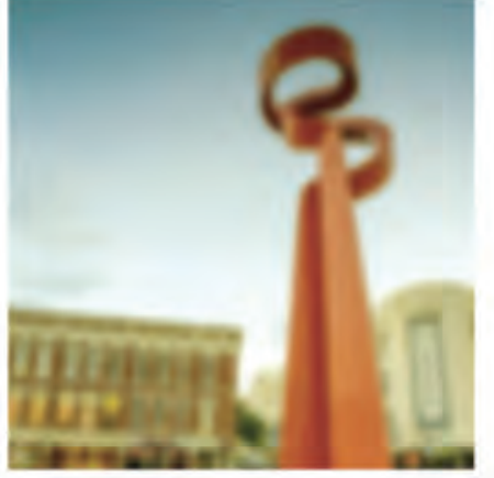
Vision With Cataracts