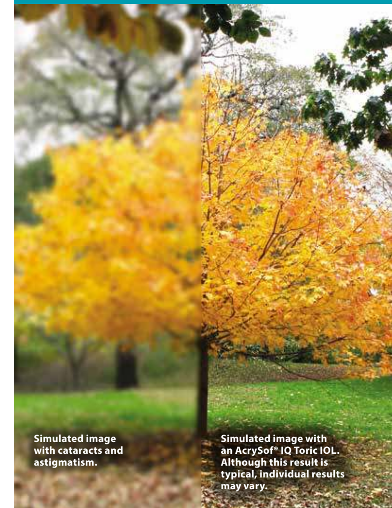
Simulated image with cataracts and astigmatism.