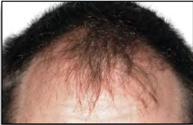
Hairline before the procedure

Hair growth typically begins around the 3 rd and 4 th month after your procedure. The majority of hair growth usually occurs between 5 and 8 months following your procedure, with the remainder of growth between 8 and 12 months. This is a guideline regarding hair growth following your procedure. There are some patients who experience all of their growth early and some patients experience growth up to 1 year or more post-procedurally.