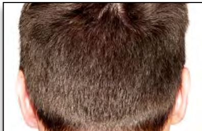
Donor area - 9 months later