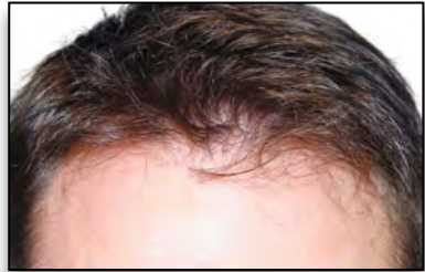
Hairline 9 months later