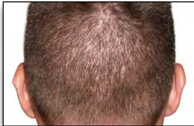
Donor area - 1 week later