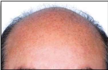
Hairline before the procedure