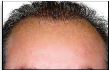
Hairline 12 months later

Precision robotics and your physician's expertise deliver safe, consistent, natural-looking results you can enjoy for a lifetime.