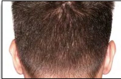
Donor area - Before procedure