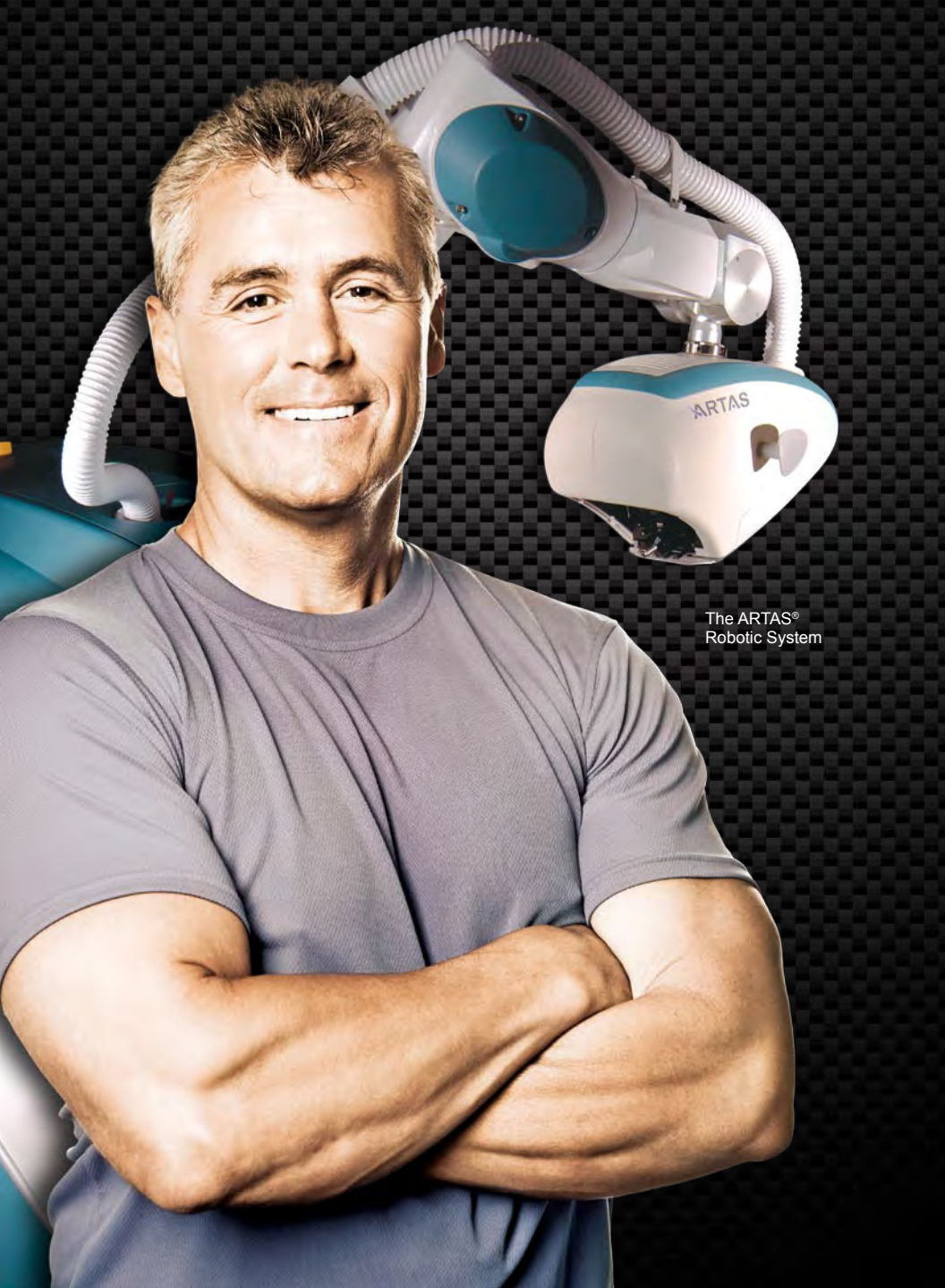
The ARTAS® Robotic System