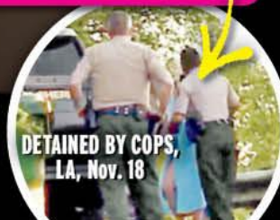
DETAINED BY COPS, LA., Nov. 18