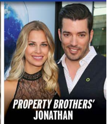
PROPERTY BROTHERS' JONATHAN